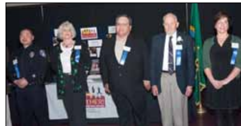
A few of of 2011's Champions for Kids