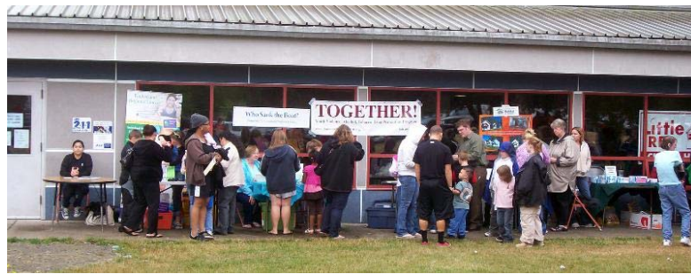
Little Red Schoolhouse is a project of TOGETHER!.